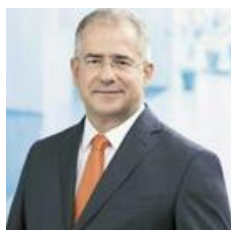
Mr Lajos KÓSA Head of Delegation Chair Committee on Defence and Law Enforcement FIDESZ - PATRIOTS