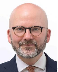
Charlie WEIMERS (SE) ECR