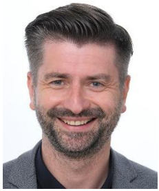
Krzysztof ŚMISZEK (PL) S&D