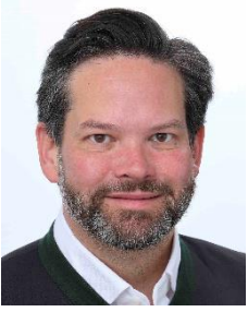
Lukas MANDL (AT) EPP