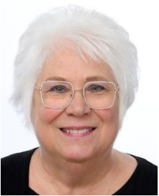
Marina KALJURAND (EE) S&D