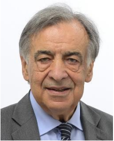
Leoluca ORLANDO (IT) Greens/EFA