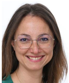
Saskia BRICMONT (BE) Greens/EFA