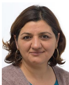
Özlem DEMIREL (DE) The Left