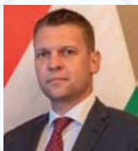
Tamás Menczer (Fidesz) Vice Chairman