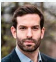
András Fekete-Győr (Momentum)