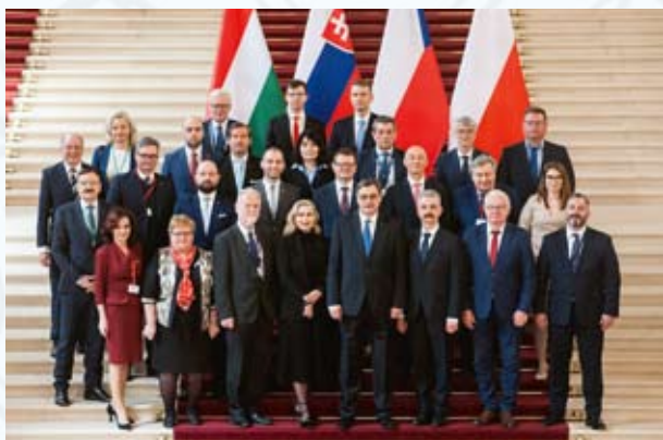
Participants of the Meeting of the Committees on European Affairs of the Visegrád Countries, Budapest, April 2023