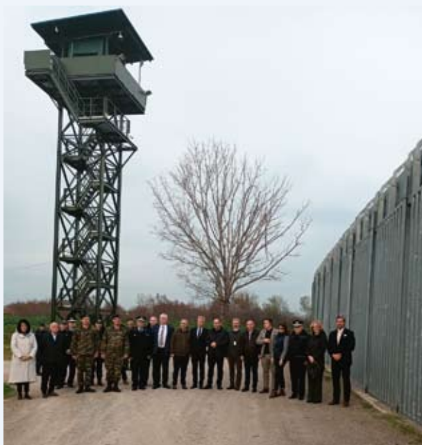
Visit of the Delegations of the Committee on European Affairs of the Hungarian National Assembly and the Permanent Subcommittee on EU Affairs of the National Council of the Austrian Parliament at the Greek-Turkish land border, Evros, March 2024