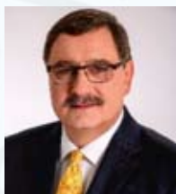
Dr. Richárd Hörcsik (Fidesz)